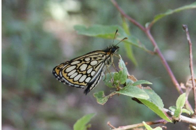
Large Chequered Skipper Heteropterus morpheus

Pieridae: Black-veined White ( Aporia crataegi ) is locally common in a range of habitats but Western Dappled White ( Euchloe craemeri ) is largely restricted to the coast of Charente-Maritime, the first individuals appearing in April. There are no recent records of Bath White ( Pontia daplidice ). Clouded Yellow ( Colias crocea ) is common and Berger's Clouded Yellow ( C. alfacariensis ) occurs where the food plant (horseshoe vetch) occurs. Pale Clouded Yellow ( C. hyale ) is rarely seen, normally on migration in September. Many early records of Pale Clouded Yellow are probably Berger's. The Brimstone ( Gonepteryx rhamni ) is widespread and the Cleopatra ( G. cleopatra ) is occasionally recorded in the south of Charente-Maritime and Charente.