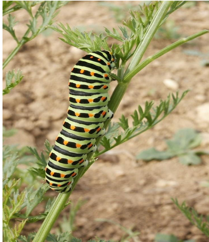
Scarce Swallowtail Iphiclides podalirius Swallowtail Papilio machaon

Lycaenidae: The hairstreaks are well represented with 3 Satyrium species - Ilex Hairstreak, ( S.ilicis ), Sloe Hairstreak ( S.acaciae ) and Blue Spot Hairstreak ( S.spini ) in addition to the British ones. These occur in June but only Ilex Hairstreak is reasonably abundant (in scrubby woodland). The others are very local.