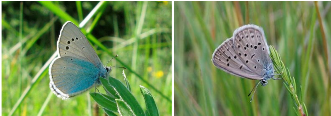
Green-underside Blue Glaucopsyche alexis Alcon Blue Phengaris alcon

Nymphalidae: Lesser Purple Emperor ( Apatura ilia ) is much more widespread than Purple Emperor ( A.iris ), occurring normally in woods near rivers or streams. It is bivoltine, the first generation appearing in June, the second in August/ September (when individuals stray into our garden to feed on fallen pears). The Purple Emperor occurs in established deciduous forests and is on the wing in July. White Admiral ( Limenitis camilla ) and Southern White Admiral ( Limenitis reducta ) are common in deciduous woodland. They have long flight periods, the former from June to August in one generation and the latter from May, exceptionally April, to September, probably in 2 generations.