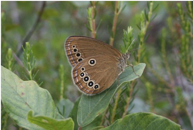
False Ringlet Coenonympha oedippus

Amongst the browns (Satyridae), one should mention the Woodland Brown ( Lopinga achine ), restricted to certain ancient woodlands; Pearly Heath ( Coenonympha arcania ) common in light woodland on calcareous soils; False Ringlet ( Coenonympha oedippus ), formerly common in marshy areas in the west of the region but now largely restricted to heathy marshland in the extreme south of Charente and Charente-Maritime where it is still locally abundant (this is another species unusual in that it is largely restricted to the west of France) ; Great Banded Grayling ( Brintesia circe ), widely distributed but seldom seen in large numbers, whereas the similar Woodland Grayling ( Hipparchia fagi ) is much more local, occurring in light woodland, where it can be numerous; Tree Grayling ( Hipparchia statilinus ) is present at a few sites in the south of Charente-Maritime; False Grayling ( Arethusana arethusia ), occurring in August and September is locally abundant; and finally the Dryad ( Minois dryas ) which is locally abundant in light woodland on alkaline soils.